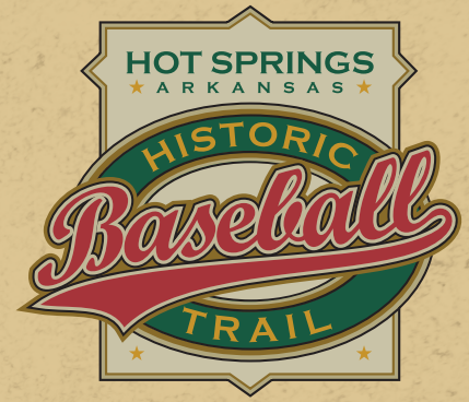
The Birthplace of Spring Baseball